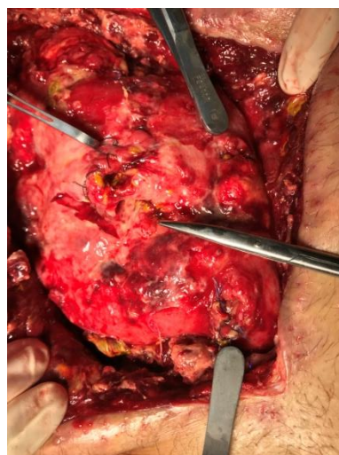
Figure (1): Major breakdown of the laparotomy wound. The small bowel loops seen in the wound are very inflamed and densely adherent with multiple fistula openings.

The patient was resuscitated; laparostomy wound care was initiated with sepsis control. Total parenteral nutrition started, and nonoperative therapy continued initially to resolve infection and inflammation and restore the peritoneal cavity. Wound exploration showed that the fistulas involved multiple bowel loops from different levels, including the proximal jejunum. In 3 months of medical management, most small bowel fistulas closed spontaneously, and the laparostomy wound partially closed. However, two large