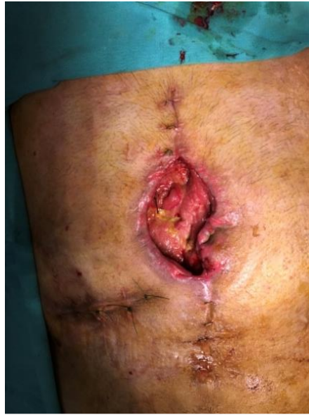
Figure (2): large proximal fistulas failed to recover with non-surgical therapy and remained to leak bile and pancreatic secretions rich fluid in large volumes.

At this point, we decided to insert coverer metal stents to bypass the remaining two large enterocutaneous fistulas (ECFs), aiming to help control soiling, relieve excoriation, reduce fluid loss, and resume oral feeding. We used two large diameters (23 mm) partially covered stents. The metal stents were controlled with multiple bands before the introducing catheter was removed to allow the stent from both sides from the fistula lumen. Half of the metal stent was deployed in one side of the fistulated