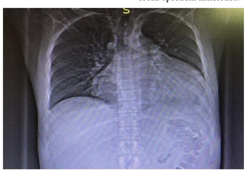
Figure (1): Chest radiograph showing flask-shaped heart.

"Ischemic hepatitis triggered by cardiac tamponade: ....." enlarged liver (liver span was 22 cm) with a round border, soft surface, and no nodularity. Electrocardiography revealed P mitral and electrical alternans, but no ischemic changes were detected. Chest radiography showed an increased cardiothoracic ratio and a flaskshaped heart (Figure 1). Extensive laboratory investigations showed elevated alanine aminotransferase (ALT) and aspartate aminotransferase (AST) (7000 and 5000 U/L, respectively), lactate of 4 mmol/L, total serum bilirubin (TSB) of 0.5 mg/dl, prothrombin time (PT) of 18.5 seconds, and international normalized ratio (INR) of 1.6. Additionally, he had elevated levels of blood urea nitrogen (BUN) and creatinine, which were 126.5 mg/dl and 18 mg/dl, respectively. Septic workup was significant for leukocytosis, elevated acute phase reactants levels, and moderate metabolic acidosis (pH value was 7.21 on blood gases testing), so he was started on broad-spectrum antibiotics.