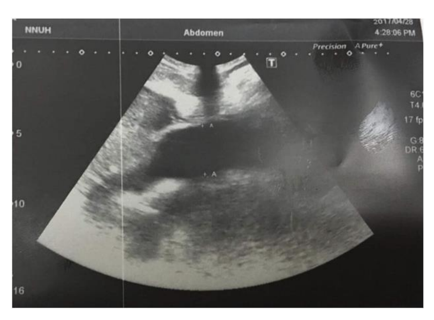
Figure (2): Ultrasound imagining showing passive congestion of the liver.