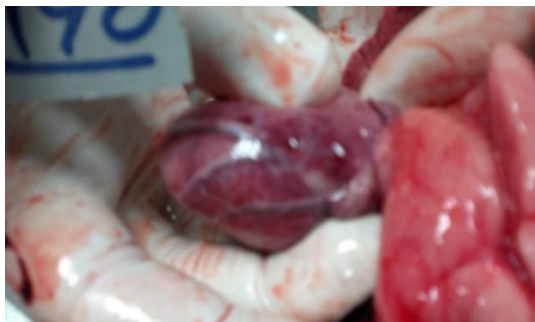
Figure (2): Petechial hemorrhages on the epicardial surfaces of the hearts.

Twin A weighed 4330 g, her crown-to-heel length was 56 cm and the head circumference was 37 cm. Twin B weighed 3880 g, her crown-to-heel length was 58 cm and the head circumference was 37 cm. Each female baby was covered with a thick orange-colored wool blanket, wear a diaper, double undershirts and wool-made trousers. There was no evidence of trauma. No injuries were noted around nostrils, mouth, ano-genital area or on the neck. No scleral or conjunctival petechial hemorrhages were noticed. The anterior fontanels in both were open and normal in shape. The skull bones showed no fractures. The meninges appeared normal. The brain weighed 470 g in twin A and 460 g in twin B. On external examination, there were multiple purple skin discolorations on the babies' backs but their sizes were smaller than 2 mm. Upon internal examination, the hearts of both looked normal without any congenital abnormalities. However, there were numerous petechial hemorrhages on the epicardial surfaces of their hearts called Tardieu spots (Figure. 2; Twin A: 20 g; twin B: 25 g), as well as multiple ecchymosis scattered all over their thymuses.