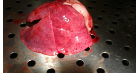
Figure (3): Edematous lungs with multiple petechial hemorrhages all over the pleura.

The lungs (twin A: left 40 g and right 55 g; twin B: left 50 g and right 55 g) were markedly edematous with multiple petechial hemorrhages all over the pleura (Figure 3). There were no foreign bodies or any materials could obstruct the airways, they were totally patent.