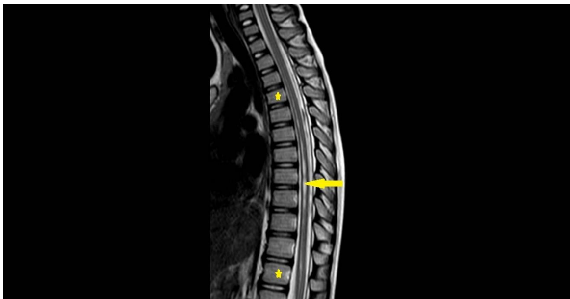
Figure (5): Sagittal T2 MRI sequence at 1 year of follow-up showing a mild increase in the transverse diameter of the syringomyelia (yellow arrow) extending from T4 to T12 (stars).