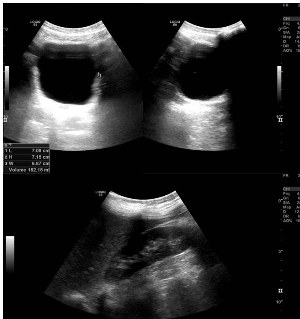
Figure (1): Urinary tract ultrasound showing normal kidneys and urinary bladder at the initial presentation.

A whole-spine MRI revealed a regular lying cord ending at the L1 vertebral body level with no kyphoscoliosis, tethered cord, split cord syndrome, or spinal dysraphism, as well as syringomyelia extending from T4 to T12 and measuring maximally about 2.7mm in anterior-posterior (AP) diameter at the D8D9 level (Figure 3). An MRI of the brain revealed no Chiari malformation or other abnormalities (Figure 4). The patient was started on the maximum dose of oxybutynin without significant improvement. As medical treatment failed, endoscopic injection of 200 international units of OnabotulinumtoxinA was tried with excellent symptomatic relief. During 3 years of follow-up, the Onabotulinumtoxin A injection was repeated twice. Urodynamic testing and radiological follow-up at one and 3 years showed no significant deterioration (Figure 5) (Figure 6).