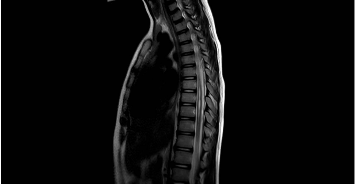
Figure (6): Sagittal T2 MRI sequence at 3 years of follow-up showing mild regression of syringomyelia.