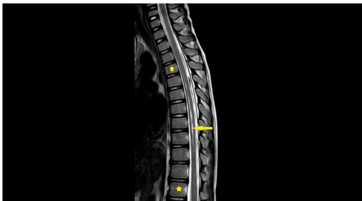
Figure (3): First MRI spine, sagittal T2 sequence showing syringomyelia of 2.7 mm in AP diameter (yellow arrow) extending from T4 to T12 (stars).