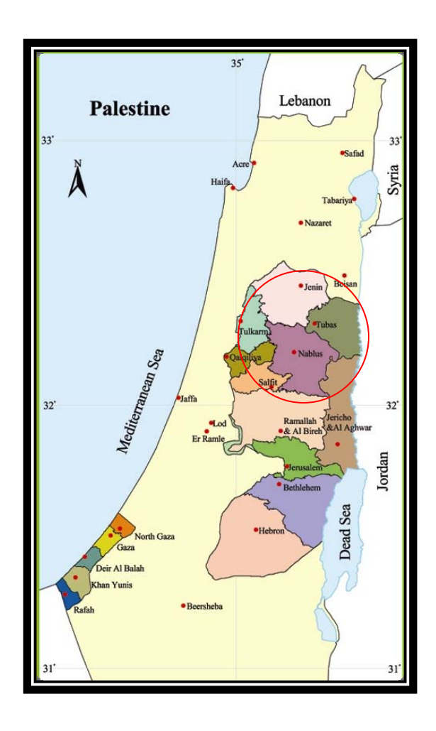
Figure (1) : Map of Palestine, where the field surveys had been carried at northern part including the three main districts (Jenin, Nablus & Tubas) shown in circle. ( Source: PCBS, 2014 ).