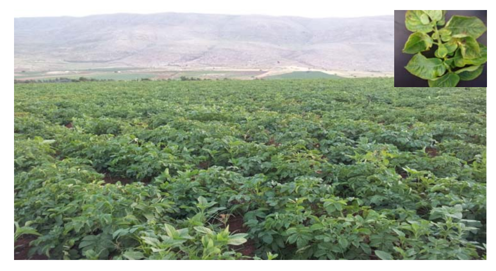
Figure (2): One of potato fields in Nablus district area that was surveyed in early spring 2014 to assess the sanitary status regarding to virus and virus-like diseases. Potato sample exhibiting slight leaf inter-vein yellowing (upright).