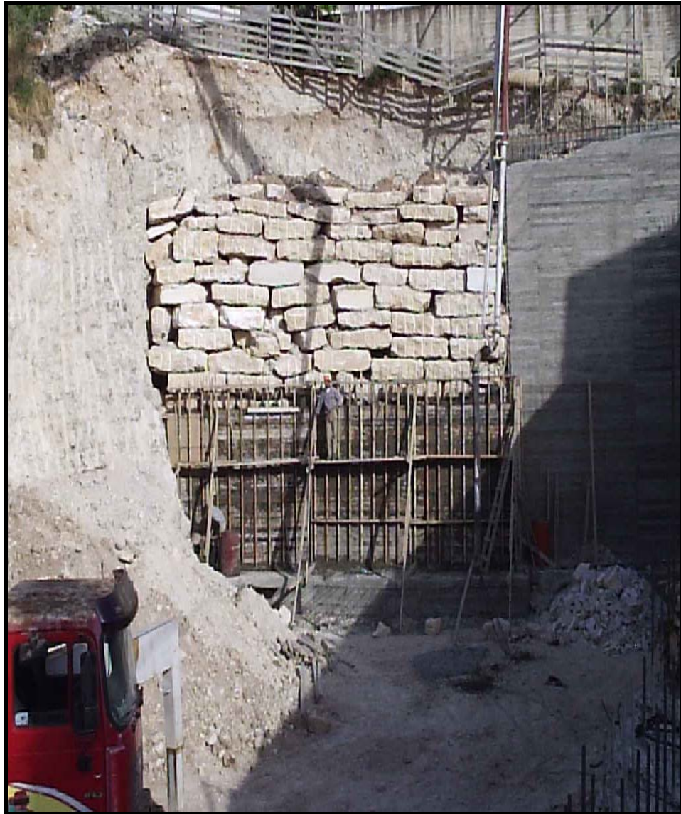
Figure (3): Blocks of rock use to stabilize the cut before constructing retaining wall