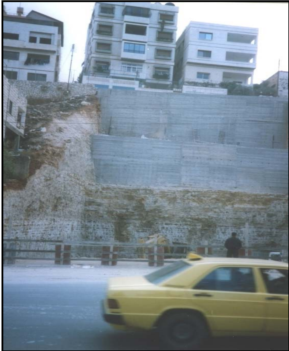
Figure (2): Successive cantilever retaining wall as bracing system